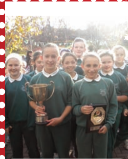
Taking the Sciath na Scol Cup back home!