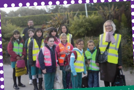
The Grange Walking Bus which runs twice weekly.

Over the last number of years, St. Columba's has been taking part in the An Taisce Green Schools' Programme. To date, we have been very successful in running the first three themes of the programme- Litter and Waste, Energy and Water. This year we are continuing our focus on the fourth theme, Travel. The aim of the travel programme is to promote sustainable travel to school, such as walking, cycling, park and stride, car pooling or taking public transport. At the moment, we have two walking buses with a third up and running in the New Year.