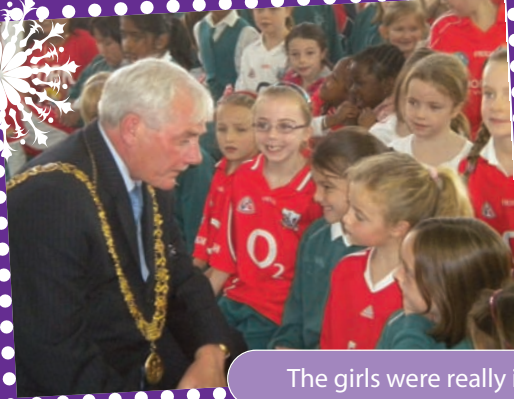
The girls were really impressed with his bling!