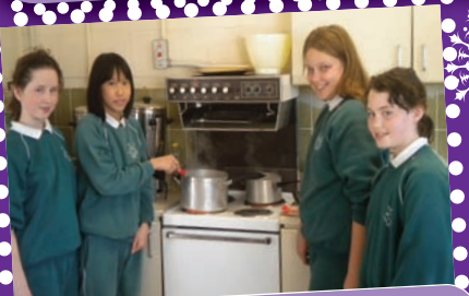
6th class cooked Chinese dumplings.

This term we celebrated many different cultures