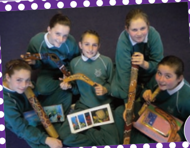
Studying the art and culture of the Aborigines was fun.

Well done to our Traffic Wardens who brave the weather morning and afternoon to ensure we all cross safely.