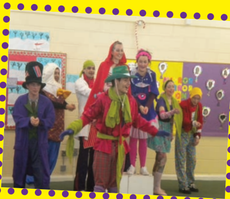
The Juniors loved Stiofan Naofa's colourful production of "Food, Glorious Food."