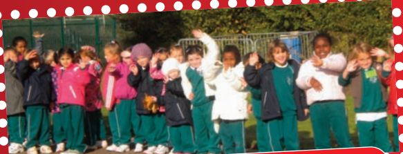
Senior Infants set off on their School Walk.

In October we all took to the highways and byways of Douglas for our annual school walk, raising almost €8000 in aid of school funds.