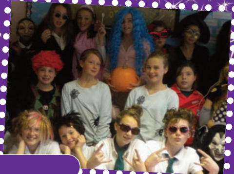
These ghouls are far too pretty to frighten anyone!