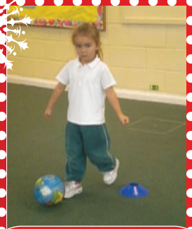
"Some day I hope I'll be in the Sciath na Scol Final!"