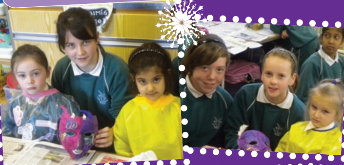
Classroom Buddies teaming up for art activities.

For the past number of years, a very successful "Buddy System" has been established in St. Columba's, whereby some of our seniors team up with our juniors for various activities. Both groups benefit enormously from these meetings.