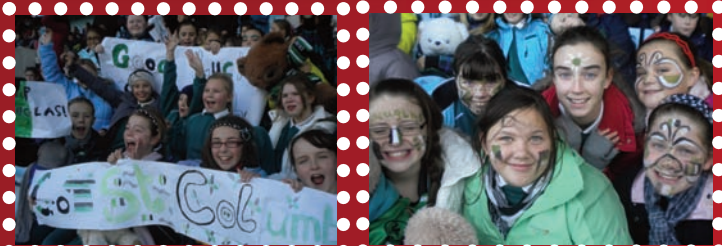
Members of the St. Columba's Supporters' Club!