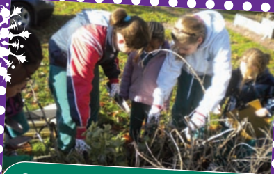
Our Garden Buddies cleared out our vegetable beds in September.