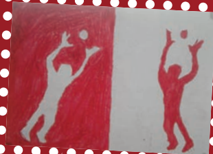
Celebrating Cork winning the All Ireland.