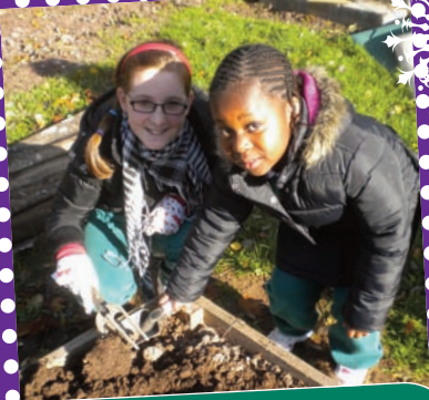
This term we've created more beds for our vegetable garden where we planted wheat, barley and oats.

A new and enthusiastic Green Committee was formed this term. The committee meets regularly to discuss ways of promoting the Travel Programme and ensuring that our school is as green as possible.